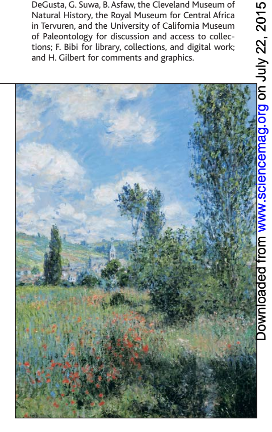
View of Vetheuil (1880), Claude Monet. Claude Monet wrote that "The subject of my painting is not light and shade, but the painting placed in light and shade."

Canopy-scale gas exchange measurements have confirmed that such effects are important (5). But although the importance